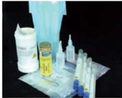
Early Evidence Kit with swabs