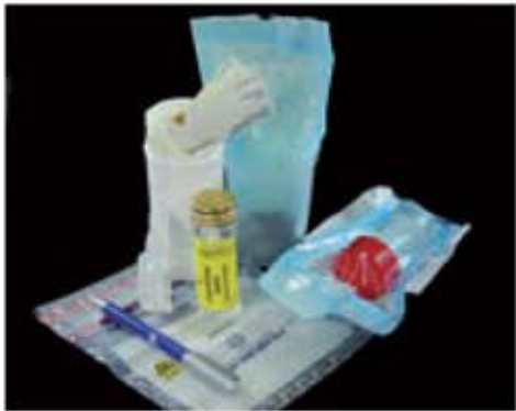
Early Evidence Kit