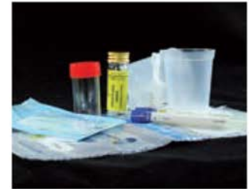
Early Evidence Kit (Two urine) with swabs