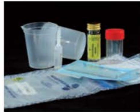
Early Evidence Kit (Two urine)